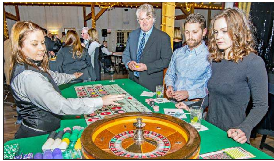
Two roulette wheels kept the crowd busy all through the evening